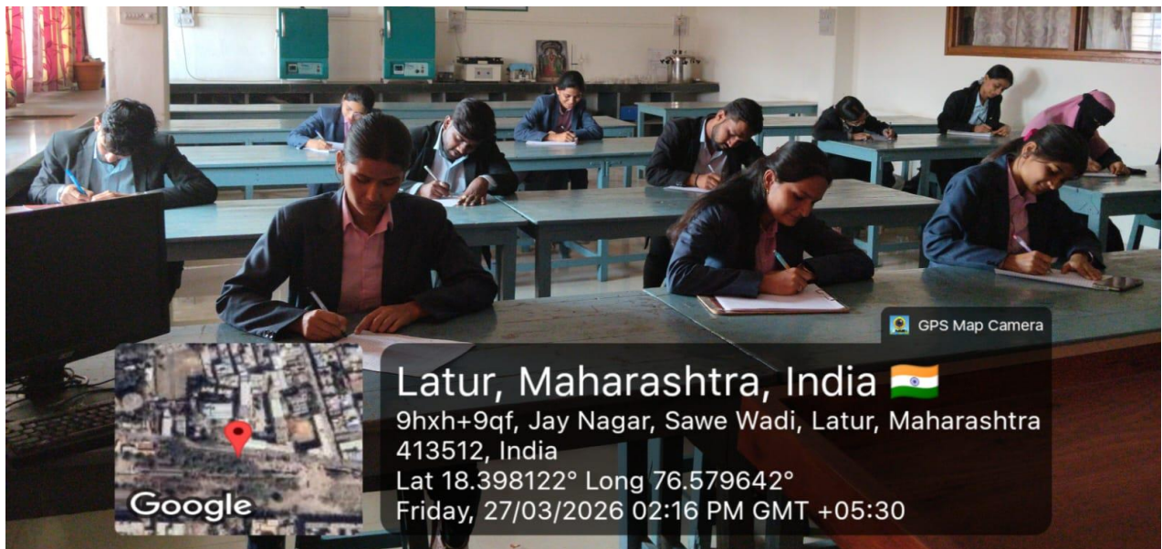
Participants involved in Essay Writing Competition.