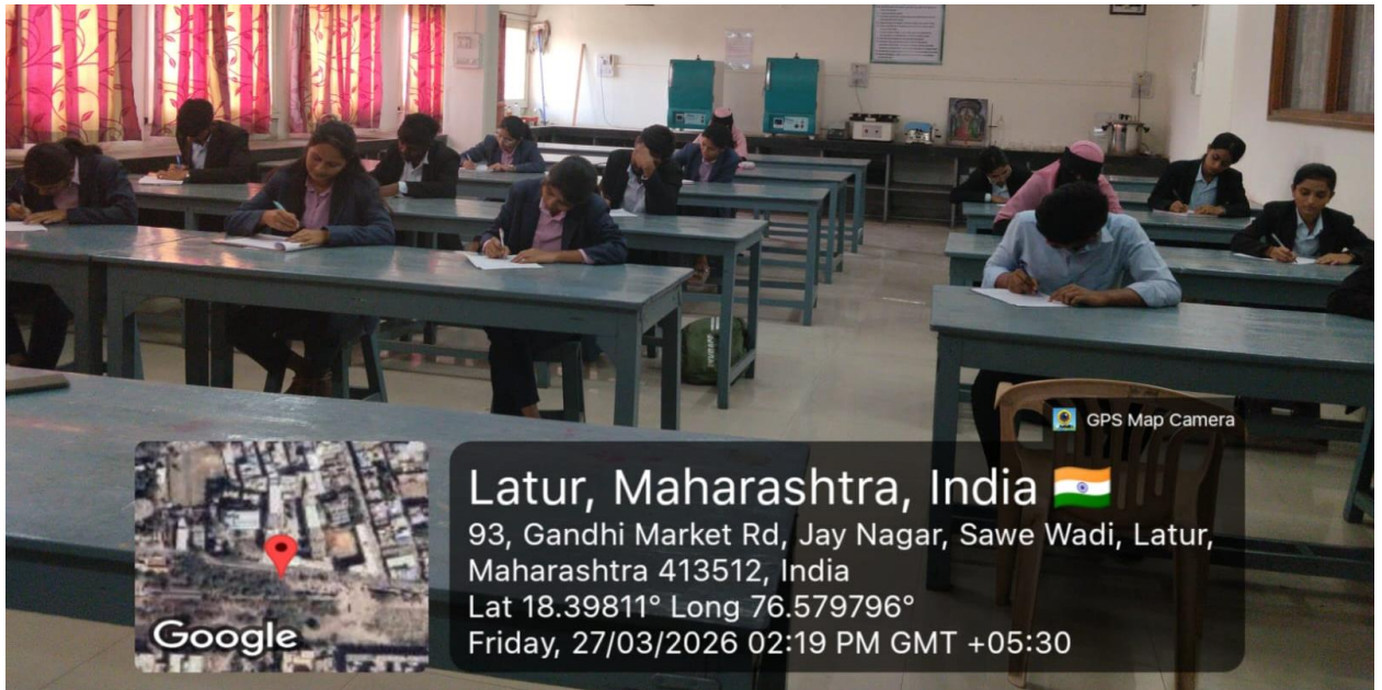
Participants involved in Essay Writing Competition.