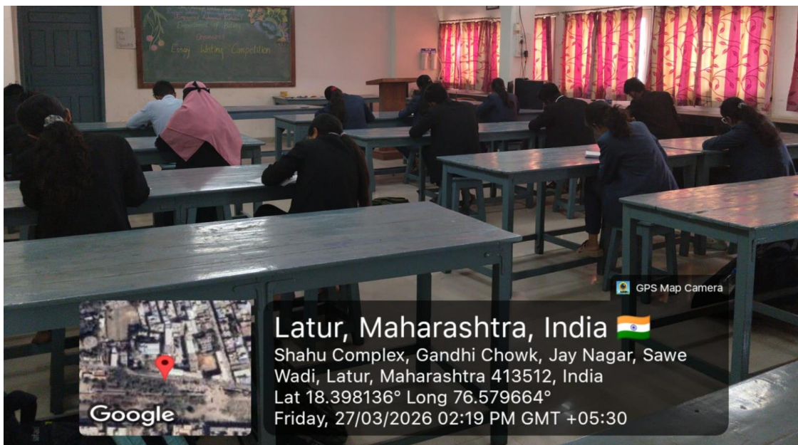
Participants involved in Essay Writing Competition